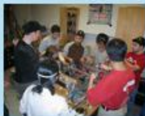
Team members all huddle around the naked drivetrain.