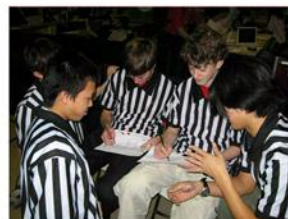
Stuyvesant referees prepare for a long day of watching matches and counting scores

A short time later, when the NYC FLL tournament at Riverbank State Park asked for referees to volunteer, 694 was ready to ship out volunteers as needed. The day went well and at the end we received a plaque to commemorate our efforts. At the end of this season, we find ourselves looking forward to another great year of participation in the worlds of FIRST robotics and FLL.