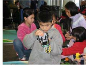
A student at Stuyvesant's Lego League competition inspects his robot before an important match.

For many years team 694 has donated mentors to nearby FLL teams, encouraging many junior high schools to join in on this spectacular program. Upon realizing that we could do so much more for the world of Legos, we decided to take our involvement one step higher. This year we held our own FLL tournament right in our own school.