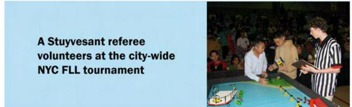
A Stuyvesant referee volunteers at the city-wide NYC FLL tournament

December 4, 2005 at 7:30 A.M. was when all of our hard work finally paid off. The day went great and the kids went happily home with their awards. We could not have possibly asked for a better turnout. Many parents came up to congratulate us on how splendidly it was done for a first try.