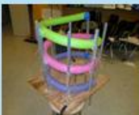
Everything good needs a prototype; a purple, pink, and blue prototype. Or maybe one with a ball stuck inside.