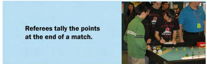
Referees tally the points at the end of a match.

About a month prior to the competition, the FIRST robotics team held a series of FLL-oriented assembly meetings to fulfill three objectives: First, we had to build the tournament tables. Second, we needed to build the actual field parts out of Legos. Finally, we needed to train team members so that they could serve as competition referees.