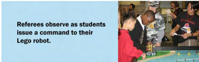
Referees observe as students issue a command to their Lego robot.